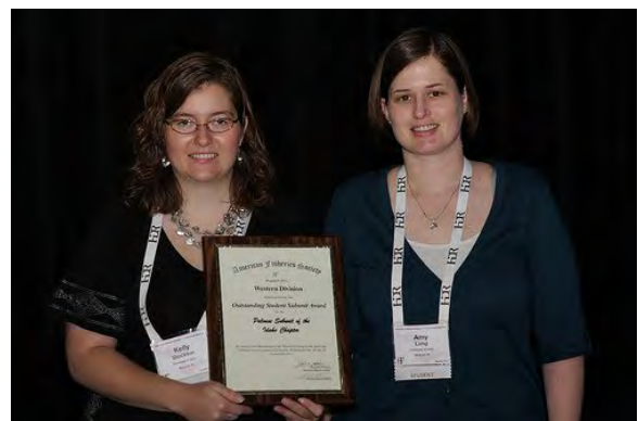
Outstanding Student Subunit - Palouse (University of Idaho)