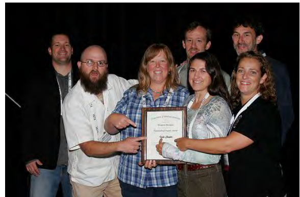
Outstanding Chapter - Oregon Chapter