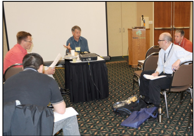
Chapter committee break-out session.