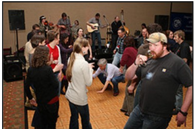
Dancing the night away after the banquet.