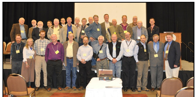
During the plenary session 29 of the past 45 presidents were in attendance to commemorate the 50th anniversary of the Idaho Chapter. A past president from each decade gave a short presentation discussing how the chapter has evolved over the years, challenges they faced, successes, and recommendations for the future.