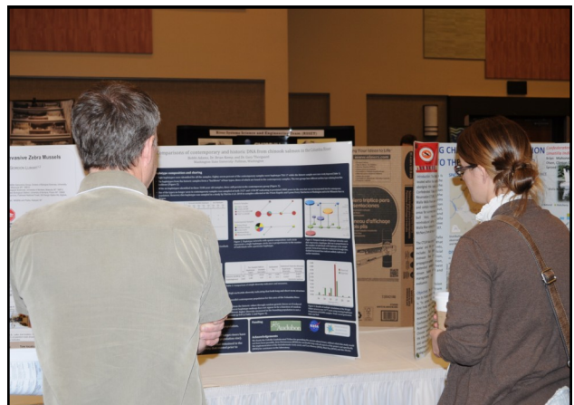
Participants mingle during poster session.