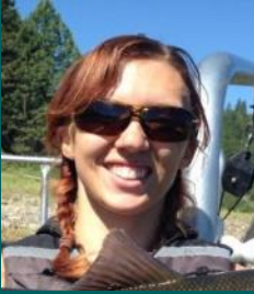
WA-BC Chapter President