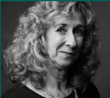
Sy Montgomery, Author

Image from http://www.matthewlomanno.com