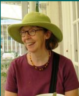
Carmel Finley, Author