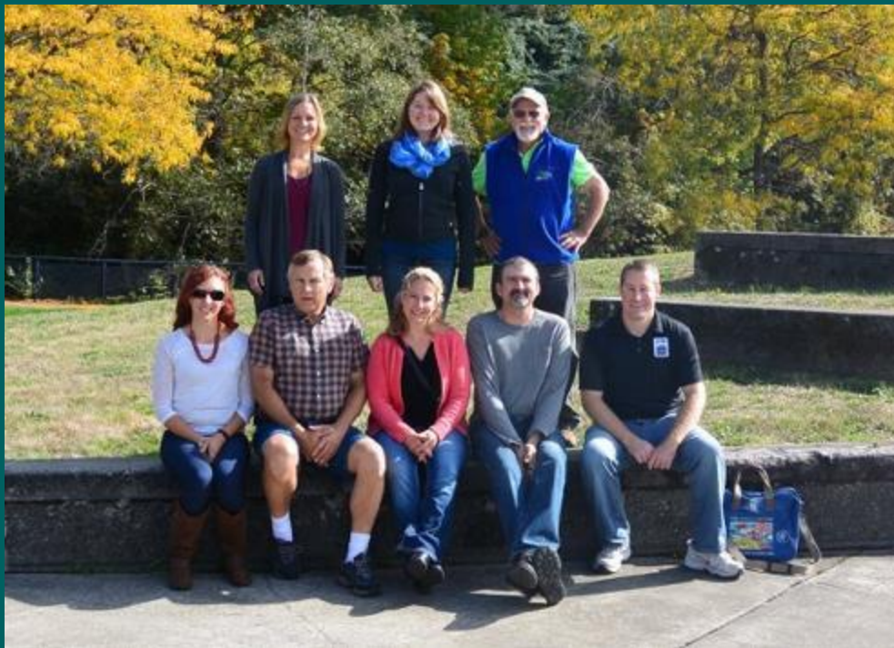
2016-2017 Executive Committee of WA-BC Chapter

Watch for the latest updates! http://agm.wabc-afs.org