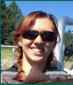
WA-BC Chapter President