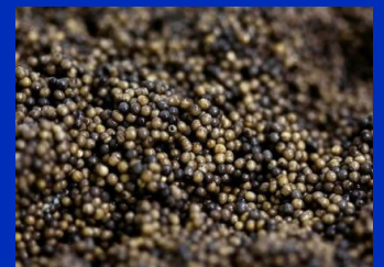
Inspiration Sturgeon (Family Acipenseridae)