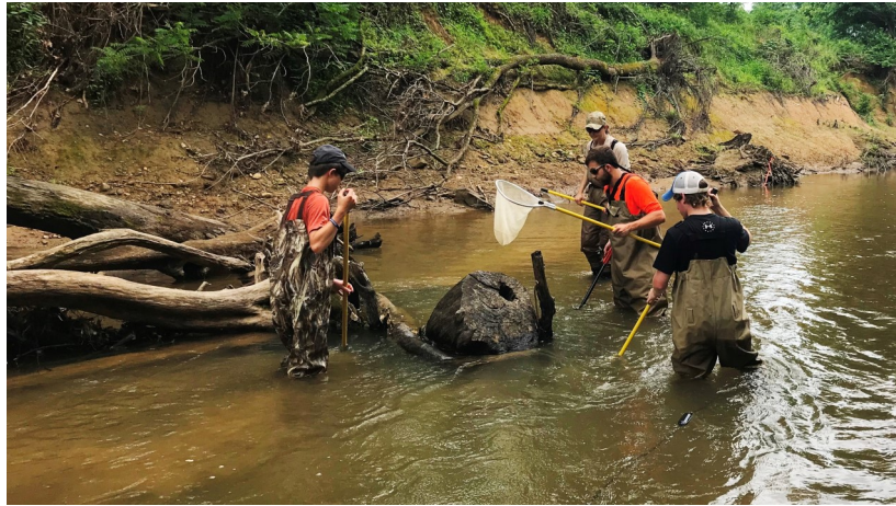
Sampling above the former Monumental Mills Dam site