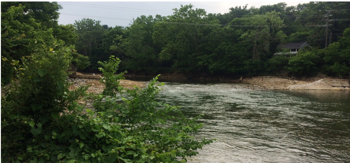
Maury River from downstream after dam removal

This effort has returned the river to a free-flowing system with diverse pool and riffle habitat, opened upstream aquatic organism passage, removed the mandatory portage for boaters, and improved public safety in City-owned Jordan's Point Park. In short order, the river will adjust to its renewed condition with vegetation re-establishing on the banks; insects, fish, and mussel communities will flourish and the public can safely enjoy the beauty of the river. ~ Louise Finger and Paul Bugas