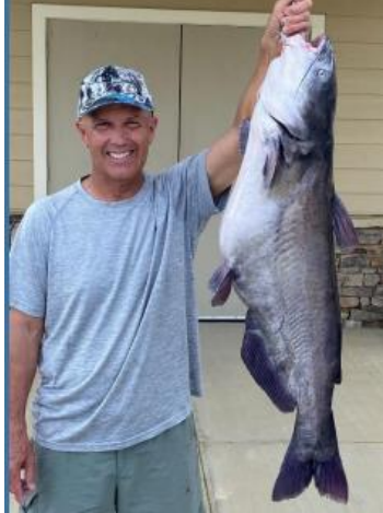
Etowah River – Blue Catfish