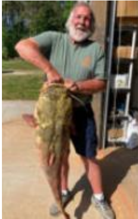
Lake Oconee – Flathead Catfish