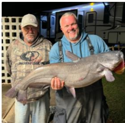
West Point Lake – Blue Catfish

Lake Oconee – Flathead Catfish – a new record 52.5lb flathead catfish was caught in April 2022.