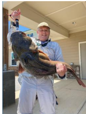
Etowah River – Flathead Catfish