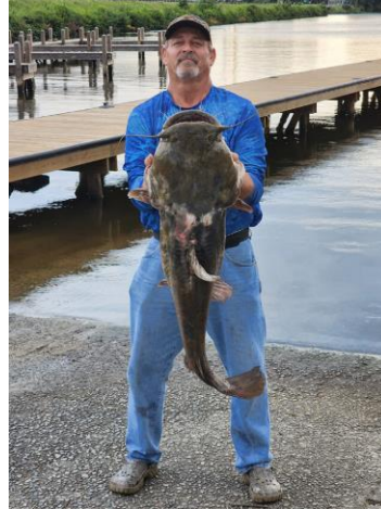
Lake Sinclair – Flathead Catfish