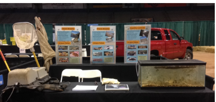
Outreach Events - Members assisted with the collection and set-up of interactive fish displays for the ODWC's Wildlife Expo. We helped OSU NREM with a campus-wide undergraduate student recruiting event. At both events, we educated folks of all ages on the diversity of fishes that occur in their backyards.