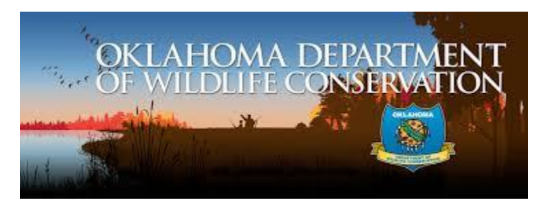
ODWC Internship Opportunities

The Oklahoma Department of Wildlife Conservation has established an Internship Program to help students that are majoring in wildlife related fields to gain work experience. The Department has a limited number of internship positions available. Positions are seasonal and vary by location and duration.