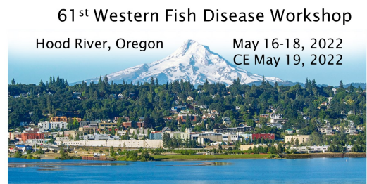
Held at the Best Western Hood River Inn and Conference Center More details and call for abstracts to come!

9th International Symposium on Aquatic Animal Health (ISAAH) Santiago, Chile September 4-8, 2022