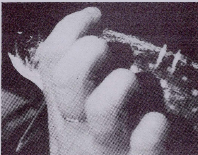
Figure 1. Silver nitrate brand immediately after marking an adult trout.

This technique was initially used for marking channel catfish (Thomas, A.E., 1975. Prog. Fish-Cult. 37:250-252) and seems applicable not only to scaleless fish but also species with small scales.