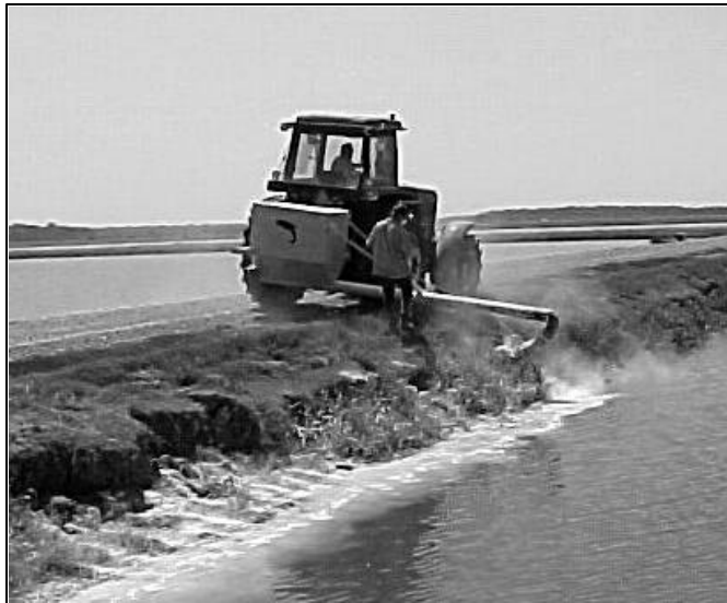
Figure 2. Application of dry hydrated lime.

Using Dry Hydrated Lime: NWAC experiments indicate that an application of hydrated lime at a rate of 50 pounds every 75-100 feet of pond bank will give partial control of snail populations. Hydrated lime is typically sold in 50-pound bags. The material is applied with an auger-equipped hopper mounted on a tractor (Figure 2). The end of the auger can be fitted with a flexible hose to allow an applicator walking behind the tractor to apply the material directly to the target area. The difficulty in applying this type of material is that the dry powder becomes airborne and can be caustic to the applicator.