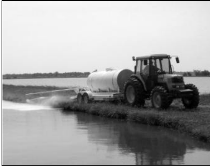
Figure 3. Application of slurried hydrated lime.

Using Slurried Hydrated Lime: Hydrated lime can also be applied as a slurry with water. The slurry is prepared at a commercial lime facility and delivered to commercial applicators or individual farmers. The bulk slurry is transferred to a large portable holding tank at the farm and subsequently pumped to smaller tanks for application (Figure 3). Formulation rates are 4.0 - 4.7 pounds of hydrated lime per gallon of water. Given this concentration, it is recommended that 20 gallons of slurry be applied per 100 feet of levee.