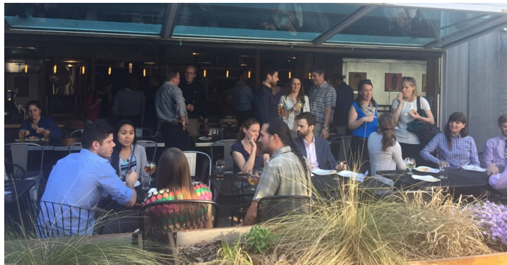
Members of the Potomac Chapter enjoy a networking event at Denizen's Brewery in Silver Spring Maryland.