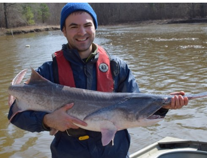
Mississippi State University Subunit members volunteered to assist with weekly Paddlefish sampling in accordance with on-going graduate research at MSU.

Attendance at professional AFS meetings was high at all levels this year. During the fall semester, members traveled to Kansas City, MO to attend the National American Fisheries Society Meeting to share their research and participate in social and networking events. More recently, several of our members attended the Southern Division of the American Fisheries Society meeting, in Oklahoma City. Five of our