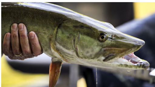
Muskie No. 35478 out of the live well.

They had been sitting there for maybe 40 minutes waiting for us to catch a fish. A writer and a photographer from the Roanoke Times had ventured into the field with us in hopes of doing a write-up on what exactly it is we do. It hadn't occurred to me that we might not catch a fish that day. It's rare we have a day like that, but they do happen.