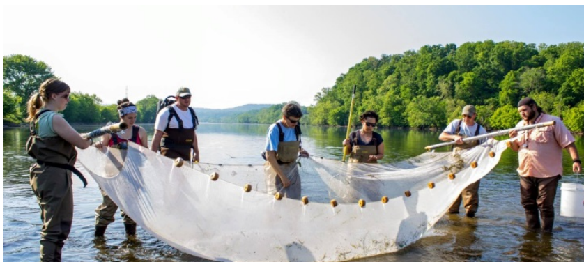
Subunit members try their hands at seining.