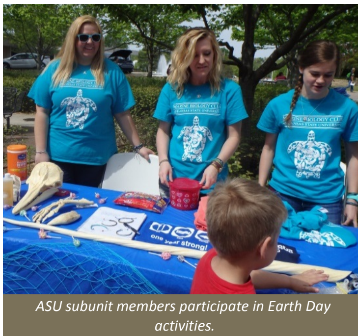
ASU subunit members participate in Earth Day activities.

chapter hosted a southern division meeting since 2000 and it was a huge success with a total of 700 registered participants. The meeting included more than 300 oral and poster presentations, 9 technical committee meetings, and 7 workshops with subject matter including courses in statistics (Intro to R; Occupancy Modeling), outreach (Social Media), job training (Electrofishing Safety; Getting Hired), and technical use of