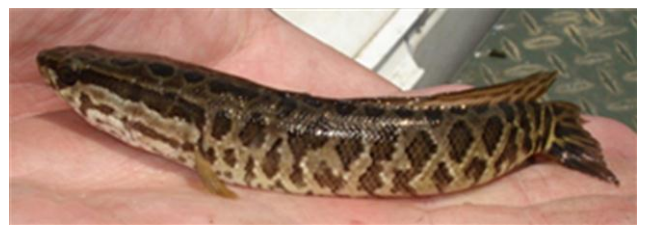
A 2010 year class northern snakehead collected by electrofishing spring 2011 in Dogue Creek, Fairfax County, VA

Northern snakeheads in Chesapeake Bay watershed continue to expand - Summer 2011 marks the continued expansion of northern snakeheads into the Chesapeake Bay and other Bay tributaries from the Potomac River. Snakeheads have been found in small drainages to the north and south of the mouth of the Potomac, but as of this writing there were no confirmed snakeheads from major adjacent river systems feeding the Bay (e.g., the Rappahannock). However, it is likely only a matter of time until the fish move along margins of reduced salinity and take advantage of major storm events to expand into the Rappahannock and other major rivers such as the James. Virginia Department of Game and Inland Fisheries surveys and angler reports indicate that snakehead abundance has significantly increased since 2010. Impacts are still unclear and will likely be hard to elucidate. For more information contact john.odenkirk@dgif.virginia.gov .