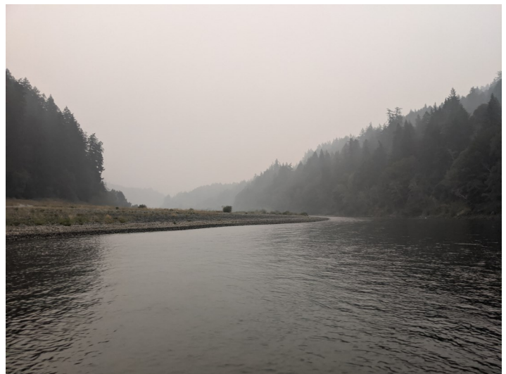
Rogue River Valley—RM13ish