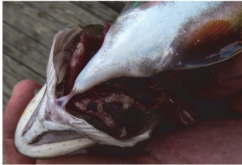
Salmincola edwardsii infection

Gill lice Salmincola spp. are a parasitic copepod that only infect Salvelinus species such as brook trout Salvelinus fontinalis , which is the only salmonid native to Wisconsin streams. The gill lice life cycle begins when egg sacs release nauplii, which immediately molt into the larval first copepodid stage during which they have about 24 hours to find a host. The larval copepods anchor onto the gills of their host and continue development. After several molts, the copepods attain