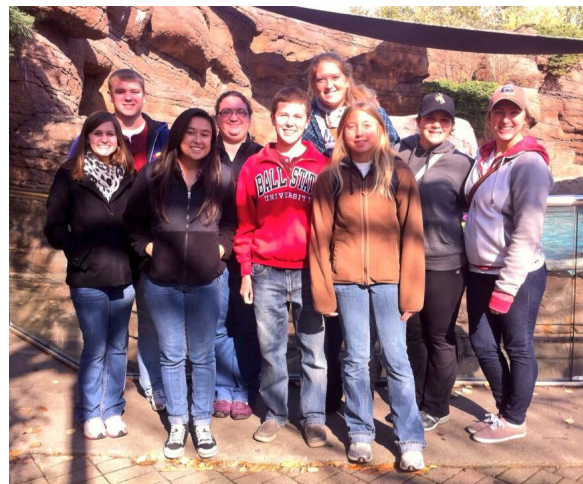
Ball State University AFS students at the Indianapolis Zoo