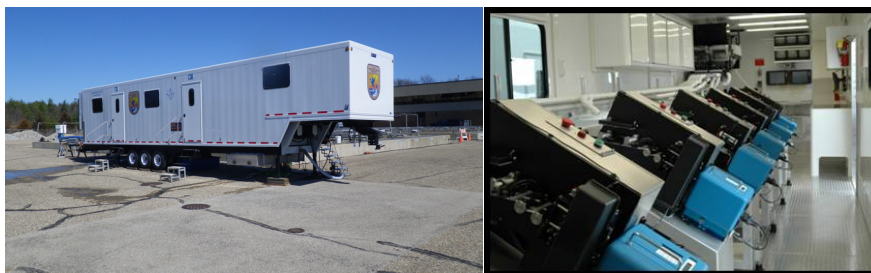
Figure 1. The AutoFish trailer, exterior and interior views.

In early March 2014, the lab began marking and coded wire tagging (CWT) Chinook salmon for the year. Over the next 2 months, Fish and Wildlife Service biologists will travel to seven state operated hatcheries in Illinois, Indiana, Michigan, and Wisconsin. About 2.4 million Chinook salmon destined for Lakes Michigan and Huron will be tagged and marked (Table). Each salmon will receive a 1-mm coded wire tag made of stainless steel and injected into the snout prior to release into the Great Lakes. Each tag has a six digit numerical code that allows fish to be traced back to a hatchery, stocking location, and year class. Along with the CWT, the fish is marked by removing its adipose fin. Removing the fin allows anglers and technicians to identify the fish as one