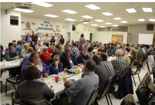
The Missouri Chapter of the American Fisheries Society celebrates its 50th Anniversary.