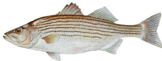
Striped Bass -- $300