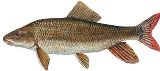
Robust Redhorse - $1,000