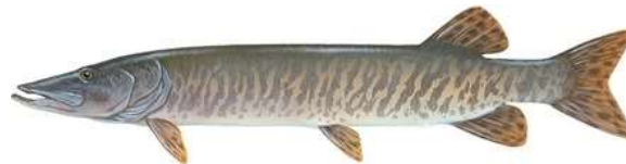
Muskellunge - $500