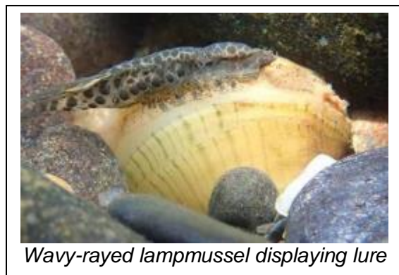
Wavy-rayed lampmussel displaying lure

NCWRC's quarterly wildlife diversity reports contain updates on a wide variety of nongame research projects and survey results. This issue includes an update on aquatic species monitoring in Lake Waccamaw, along with Spotfin Chub, freshwater mussel, and Lake Sturgeon survey information.