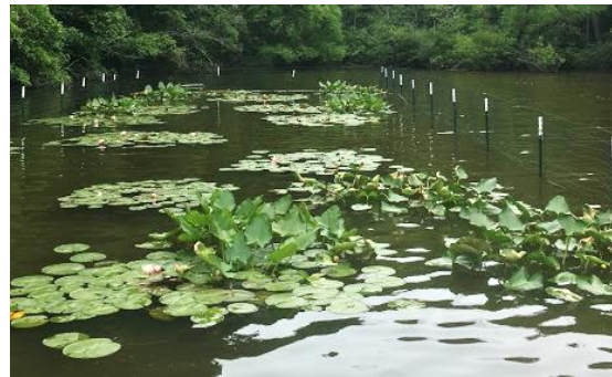
Two enclosures at Oak Hollow Lake showing Pickerelweed ( left ) versus White Water Lily and Spatterdock ( right ) as the dominant successful species.