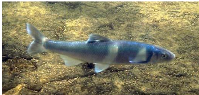
Spottfin Chub from the Little Tennessee River, NC