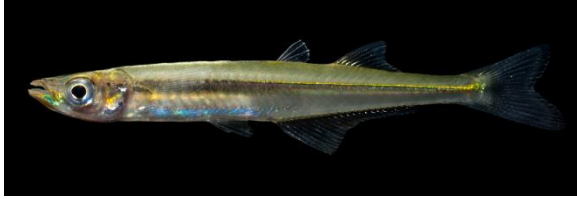
Southern Brook Silverside