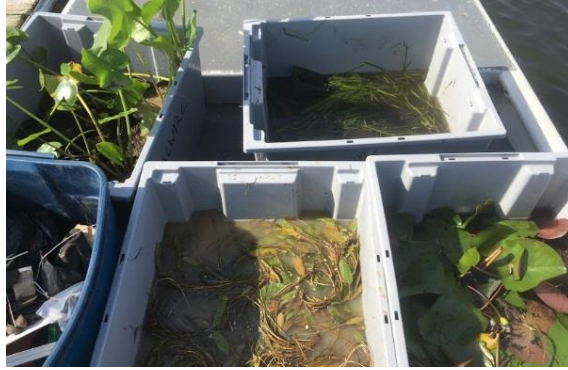
Example of how aquatic plants are transported in tubs.