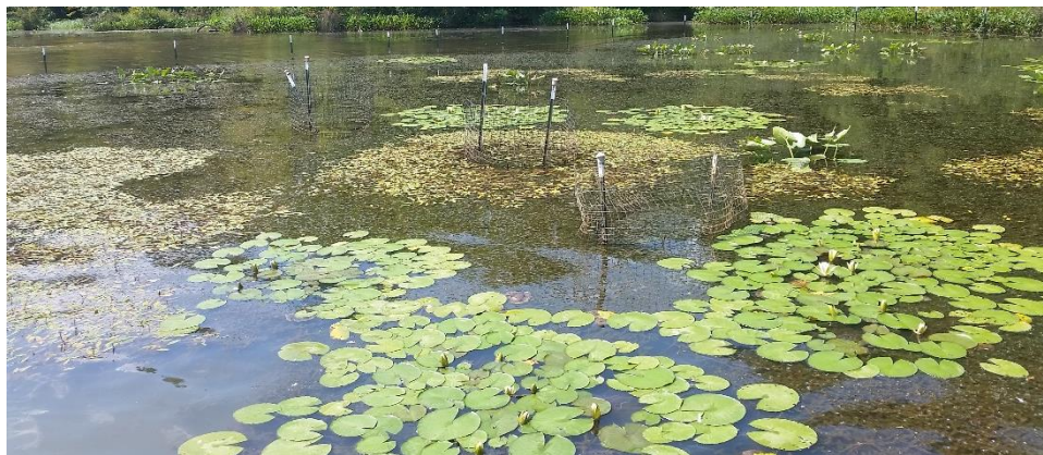
Native plants thrive amidst Hydrilla within enclosures in Lake Gaston. Herbicide treatment that primarily targets Hydrilla may be needed to reduce habitat competition with native species.