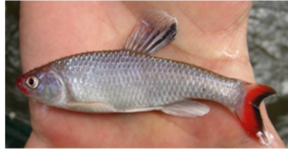
Fieryblack shiner, North Fork First Broad River.