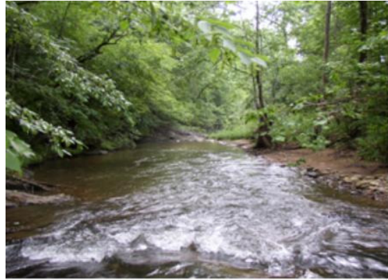
North Fork First Broad River, Rutherford County.

Reclassification Studies - Three reclassification studies were conducted in 2005 – Camp Creek (Little Tennessee River Basin), North Fork First Broad River (Broad River Basin), and Eno River (Neuse River Basin). The watershed of the North Fork First Broad River and portions of the Eno River and two of its tributaries (Rhodes and Buckquarter Creeks) qualified to be supplementally reclassified to Outstanding Resource Waters and the upper watershed of Camp Creek was found to support trout and would qualify to be supplementally reclassified as Trout Waters. The next step in the reclassification process is for this information to be presented at public meetings which will likely be held in 2006.