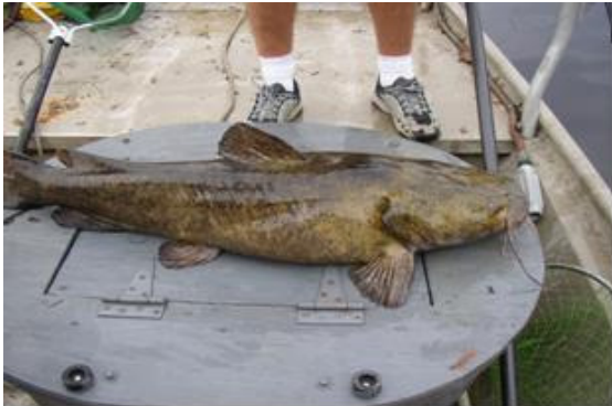
Flathead catfish, Waccamaw River.

Fish tissue sampling also continued in 2005 as part of the ongoing statewide assessment of pesticides in North Carolina's freshwater fish. The survey is intended as a Tier 1 type study whose primary goal is to identify mainstem inland waterbodies where organic contaminants exceed specified human health or environmental screening values for edible fish. Sites where contaminants are identified would require more intensive follow-up sampling. The 2005 schedule includes surveys in the Chowan, Pasquotank, Roanoke, and Catawba River Basins.