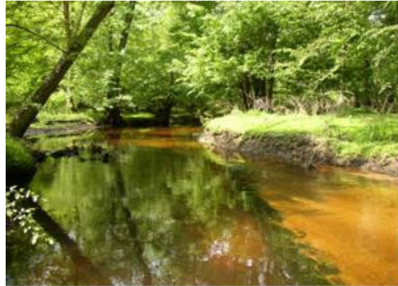
Falling Creek, Lenoir County.

Further west in the Broad River Basin, waterbodies ranged from shallow, sandy bottom streams that easily become turbid to those that have high gradient riffles and plunge pools as they drain the Eastern Blue Ridge Foothills.