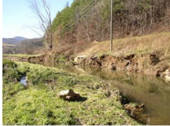
Cove Creek, Watauga County, December 02, 2004.

The fish community in South Hominy Creek (Buncombe County) declined from Good in 1997 and 2002 to Fair following the flooding. Species that inhabit the open water column such as warpaint shiner, mirror shiner, saffron shiner, river chub, creek chub, and rock bass all declined in abundance. The more benthic species such as mountain brook lamprey and the riffle inhabiting species such as northern hog sucker, mottled sculpin, and Swannanoa darter seemed to have fared better than the open water and pool inhabiting species.