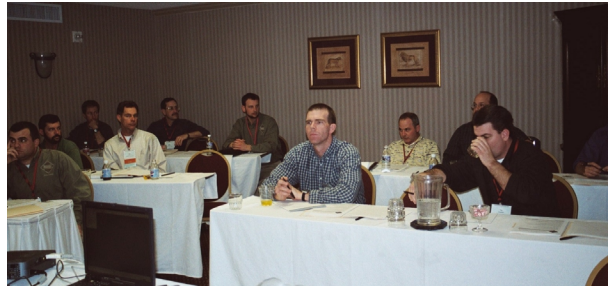
Workshop attendance was high.

The Southern Division AFS Spring Meeting held in Wilmington in February was an unqualified success with a total registration of 383! The scientific presentations, workshops and posters sessions were professionally conducted and well attended.