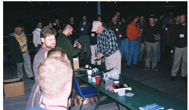
Despite a chilly night on the battleship, raffle prizes went fast!

Social events at the Hilton and battleship were enjoyable and facilitated interactions among fisheries professional throughout the Southeast.