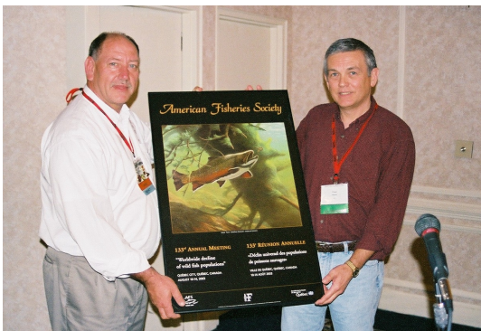
See Meetings of Interest for more details.

And finally, for the more visually oriented, let me take this opportunity to remind you of the Parent Society Meeting in Quebec.