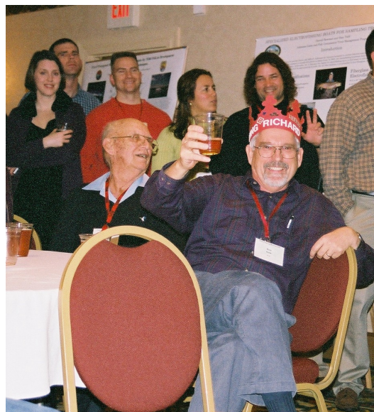
Thanks for the memories!