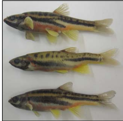
Phoxinus oreas , Ararat River, Surry County. Note scoliosis in the middle specimen.

percent ethyl alcohol has gained in importance. To assist the Museum in expanding their genetic holdings, we have also preserved material in ethanol from several river basins and for many species (e.g., Fantail Darter, Piedmont Shiner, and Redlip Shiner) over the past several years. [Note: what is ultimately preserved also depends on the restrictions set forth in one's scientific collection permit(s) issued by the NCWRC and the Division of Marine Fisheries. Consult your permit for any restrictions.]