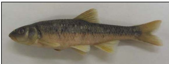
Nocomis leptocephalus X Clinostomus funduloides hybrid, Cody Creek, Surry County.

Whenever I am preparing for a sampling trip, I query the wadeable stream fish community assessment database ( http://www.esb.enr.state.nc.us/NCIBI.htm ), the river basin-specific species list ( http://www.esb.enr.state.nc.us/bau.html ), and my up-dated copy of Menhinick (1991) and make a list of the species that I am likely to encounter. This list, with any Endangered, Threatened, or Special Concern species high-lighted, accompanies me into the field in the back of my clip board. Any species that is collected that is not on that list is preserved in 10 percent formalin. Also preserved are unusually pigmented or tuberculate specimens, possible hybrids, physically deformed specimens, specimens representing new county records, and species that are known from the basin but perhaps not from the subbasin I am working in (e.g., the South Yadkin River or Ararat River watersheds).