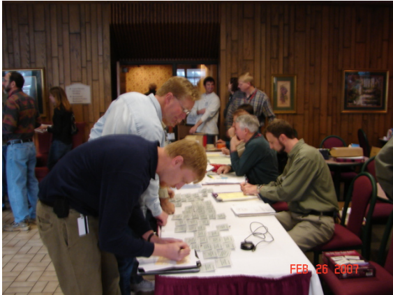
The registration tables stayed very busy on the first day of the meeting with 109 total meeting participants.

The North Carolina and Virginia Chapters of the AFS co-hosted a very successful annual meeting in Danville, VA on February 26-28. A total of 109 members attended with an almost equal split between the North Carolina and Virginia Chapters. Student turnout from Virginia and North Carolina was excellent.