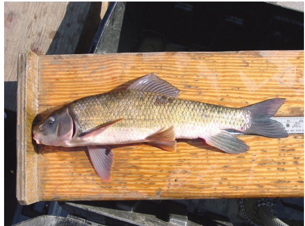
Adult Carolina redhorse (481 mm TL, 1250 grams weight) collected on the Pee Dee River near Cheraw, SC, on May 6, 2002.

Survey efforts by participating agencies have found four robust redhorse in the Pee Dee River during the period of 2000-2002. Two of the specimens have been adult females, located in the Fall Line zone of the river in North Carolina while two juveniles have been collected in the South Carolina Coastal Plain region of the river. Prior to these individuals, only two other robust redhorse have been collected from the Yadkin-Pee Dee River.