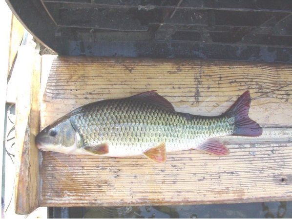
Juvenile robust redhorse (430 mm TL, 1125 grams weight, 3 years of age) collected on the Pee Dee River, South Carolina, May 10, 2002.

Society Hill while the two Carolina redhorses were collected near Cheraw, SC, and the other Carolina redhorse was collected just below the Blewett Dam in North Carolina.