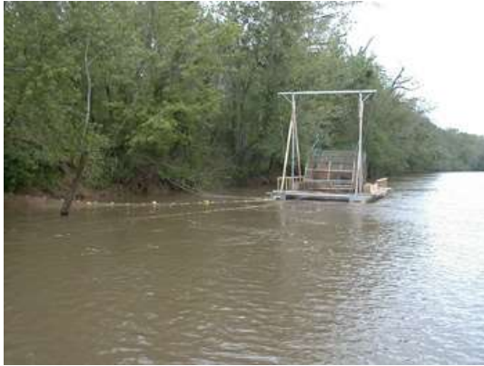
Fishwheel currently in operation on the Roanoke River

Starting in the early spring of 2000, we began using a "modernized" fishwheel to examine the timing of migration and relative abundance of anadromous species in the Roanoke River. As far as we know, this is the first time that this old technology has been used for research purposes on the East Coast. Fish are captured in the fishwheel baskets as they swim upstream and are guided into flow-through live wells set in the platform. The size and design of the live wells allows large numbers of fish to be held in excellent condition. The fishwheel collects fish 24 hours a day, turned by the natural flow of the river, and the live wells are checked once daily. All fish captured are then measured, weighed, and released.