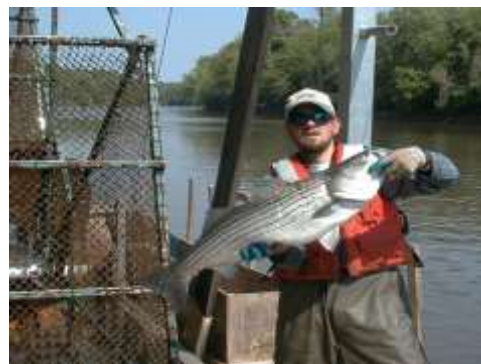
A large striped bass captured in the fishwheel during the 2001 season

The migrations of the various species take place from late February through the middle of June. Hickory shad catches were thought to be low in 2000 because the fishwheel was not operating continuously until March 30. However, in 2001, the fishwheel has operated since early February so the low catch of hickory shad this year is unexplained. Our catch of American shad has been consistently low. Other surveys also indicate that their abundance is quite low. The North Carolina Wildlife Resources Commission, U. S. Fish and Wildlife Service, and others have begun a