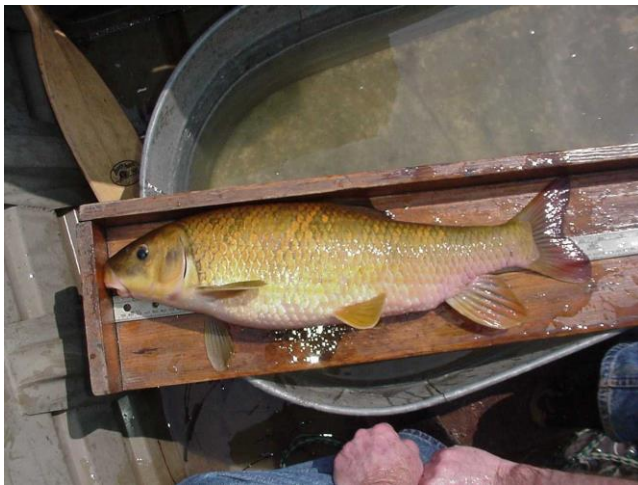
Robust redhorse ( Moxostoma robustum ) specimen collected from the Pee Dee River in North Carolina on 26 April 2000.

The robust redhorse is known to maintain populations in limited portions of the Oconee and Ocmulgee rivers, GA, and the Savannah River, GA-SC. The presence of this species in the Pee Dee River suggests other Atlantic slope drainages may hold populations of this species where it historically may have occurred. Future surveys of the Pee Dee River should help address questions of the distribution and abundance of this species in this river as well as insights into population structure and dynamics. Surveying the Pee Dee River and other Atlantic slope rivers is a research priority outlined by the Robust Redhorse Conservation Committee, a consortium of state and federal agencies, environmental organizations, and power utility companies that has been involved in conservation efforts regarding the robust redhorse since its initial re-discovery in the Oconee River in Georgia during 1991.