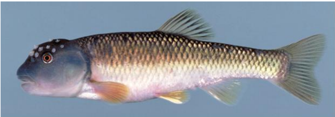
Figure 1. Breeding male of the Bluehead Chub, Nocomis leptocephalus , showing its characteristic swollen bluish head and white breeding tubercles atop its head.

The specimens were collected in the early 1850s (precise date unknown) by J. T. Lineback (correctly spelled Linebach), one of the founding families of the Moravian community of Salem in Forsyth County. Lineback was assisted by students from Salem Academy, a women’s school in Salem which opened in 1772, and Salem College, the oldest women’s college in the nation. Remarkable is the fact that the specimens were collected in the early 1850s by women, during a time when few women were afforded an education. Historically, when a species was first described the author often did not specify a type locality. A type locality is the place where the population occurs from