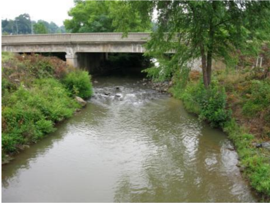
Figure 3. Salem Creek, looking upstream from the South Main Street bridge, City of Winston-Salem, Forsyth County. Riffle from which specimens of the Bluehead Chub were collected in July 2009 can be seen just downstream from the pedestrian walkway bridge.

Rosefin Shiner, Lythrurus ardens , and Flathead Catfish, Pylodictis olivaris (including a specimen ~ 850 mm TL).