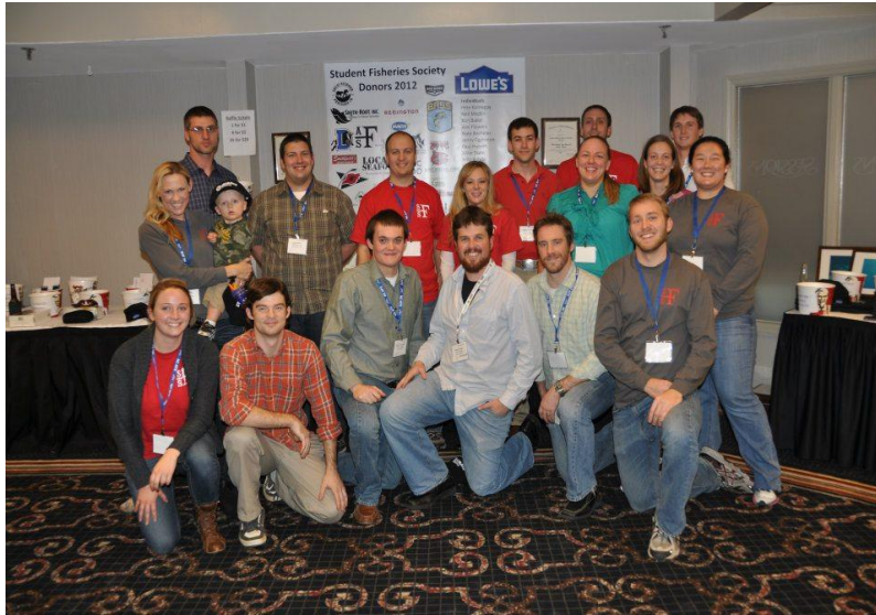
SFS dedicated members had a great. time making the student fundraiser a success