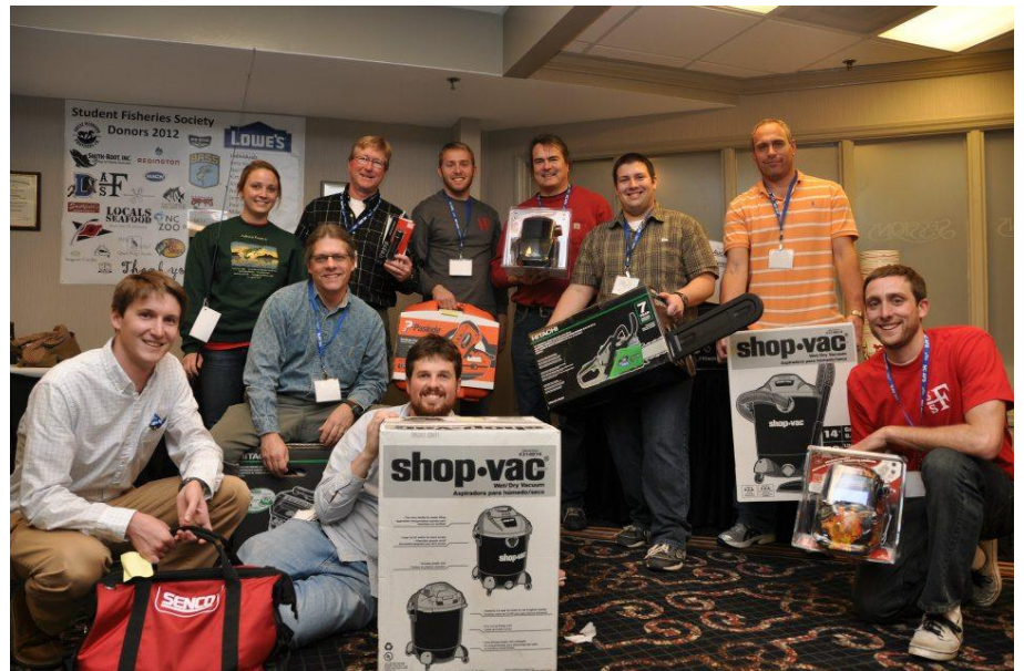
A few of the lucky winners of great prizes given away during the NCSU student raffle/auction.

With spring came the start of many field sessions and many more outreach activities. We participated with three water-body clean ups. Lake Raleigh on Centennial Campus of NCSU has become a pet project of our group for classes. We have noticed an accumulation of trash and helped clean up on a beautiful Saturday morning. We also organized a cleanup on another Saturday morning of our adopted section of Rocky Branch Creek on the Main Campus. Finally, we participated in our continued effort to help clean up the Neuse River.