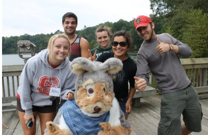
Several SFS members gather around Yates Mill's mascot during the Fall Harvest Celebration.