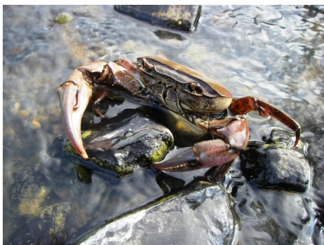
In Africa native freshwater crabs are likely to be impacted by invasive crayfish

morphology during the crayfish surveys and found no evidence of differences in crab abundance or body condition when crayfish were present compared to the uninvaded systems. These are positive results as they suggest that the native crabs show some resistance towards the invasion. This evidence goes against the commonly accepted notion that species with no co-evolutionary history will usually be disproportionately affected by successful invasive species. Crayfish are opportunistic scavengers and tend to entangle themselves into fishing gears while feeding on caught fish. This destroys both fish and the nets, which can incur cost to the individual fisher. This is could be a particularly damaging phenomenon in areas with high abundances of crayfish. Unfortunately, crayfish are also able to catch and consume high numbers of juvenile fish and invertebrates which could be having knock on effects in terms of fish recruitment and consequently fishers catches. Understanding the trophic dynamics of the crayfish invasion in the Zambezi system remains key to determining what mitigation strategies may be effective, as well as understanding the interplay with socio-economic nuances across the region.