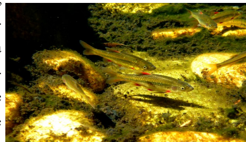
The Eastern Cape Redfin is just one of the native species threatened by Largemouth Bass predation

Casey Broom, a PhD candidate in the Weyl-Lab, is working on the Rondegat River, situated in the Cape Floristic Ecoregion biodiversity hotspot of South Africa. The Rondegat River is regarded as a keystone case study for the control of invasive alien fishes and recovery of an imperilled native fish community. This study looks at the recovery of the native fish community by monitoring fish abundance and their responses to degraded habitat for eight years after non-native fish were removed using piscicide in 2012. He used snorkel