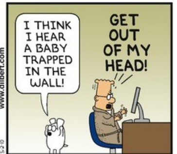
"Dilbert" funny from Sunday, May 2nd 2010