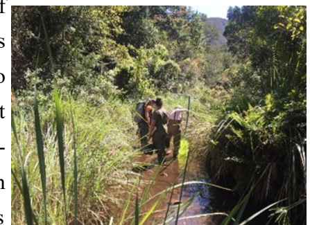
Surveying streams in the Addo Elephant National Park.