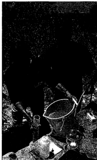
Undergraduates who participate in the SEEDS program (Strategies for Ecology Education, Development and Sustainability) attend the annual Ecological Society of America meeting, where they are paired up with ESA members who serve as mentors.

To that end, professional societies (including many AIBS member societies), institutions, and universities are trying a number of strategies to recruit and retain underrepresented minorities in the field of biology. Efforts span