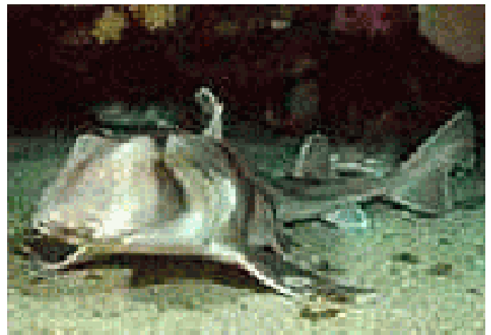
Port Jackson shark—taken from the web page of the Australian Museum. This species is considered to be one of the most, if not the most, primitive surviving elasmobranchs in our seas today.