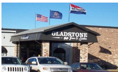
Gladstone Inn Jamestown, ND