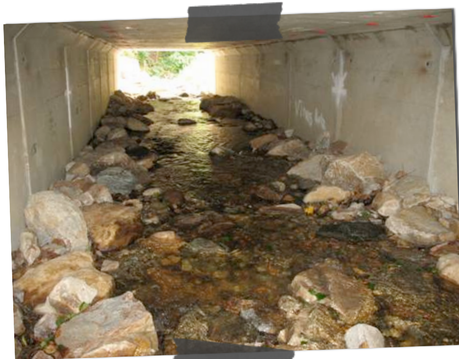
AOP friendly box culvert constructed by the Vermont Transportation Agency in Readsboro, VT.