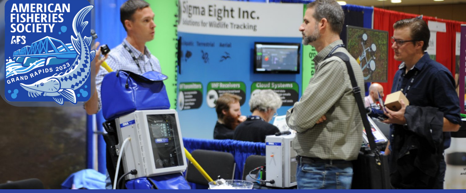
EXHIBIT AT AMERICAN FISHERIES SOCIETY 153RD ANNUAL MEETING!